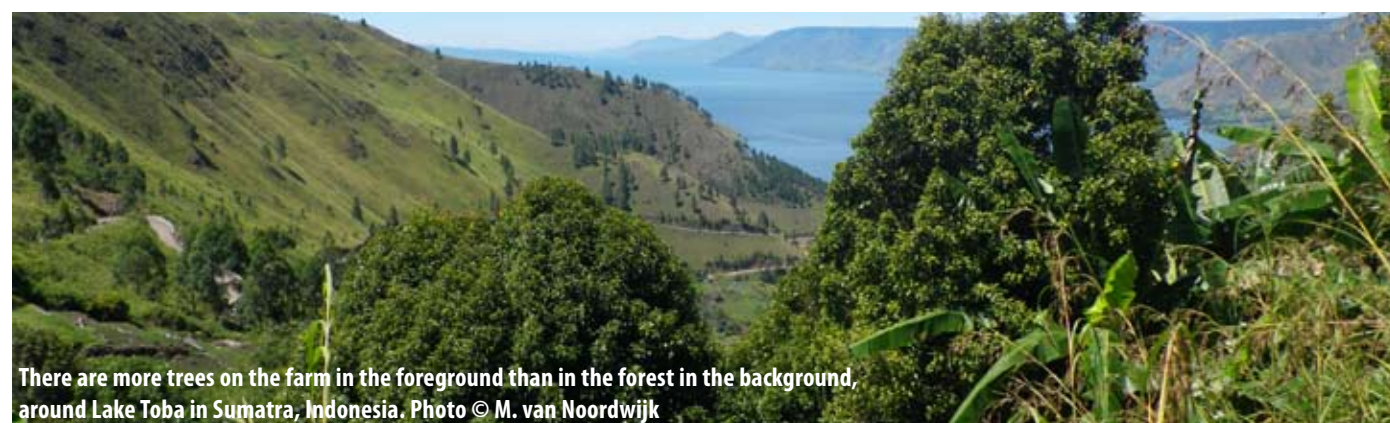
There are more trees on the farm in the foreground than in the forest in the background, around Lake Toba in Sumatra, Indonesia.

It may also be a more effective way to relate locally-appropriate mitigation actions (LAMAs) to NAMAs, and negotiate shared responsibility for reduction between districts, provinces and sectors.