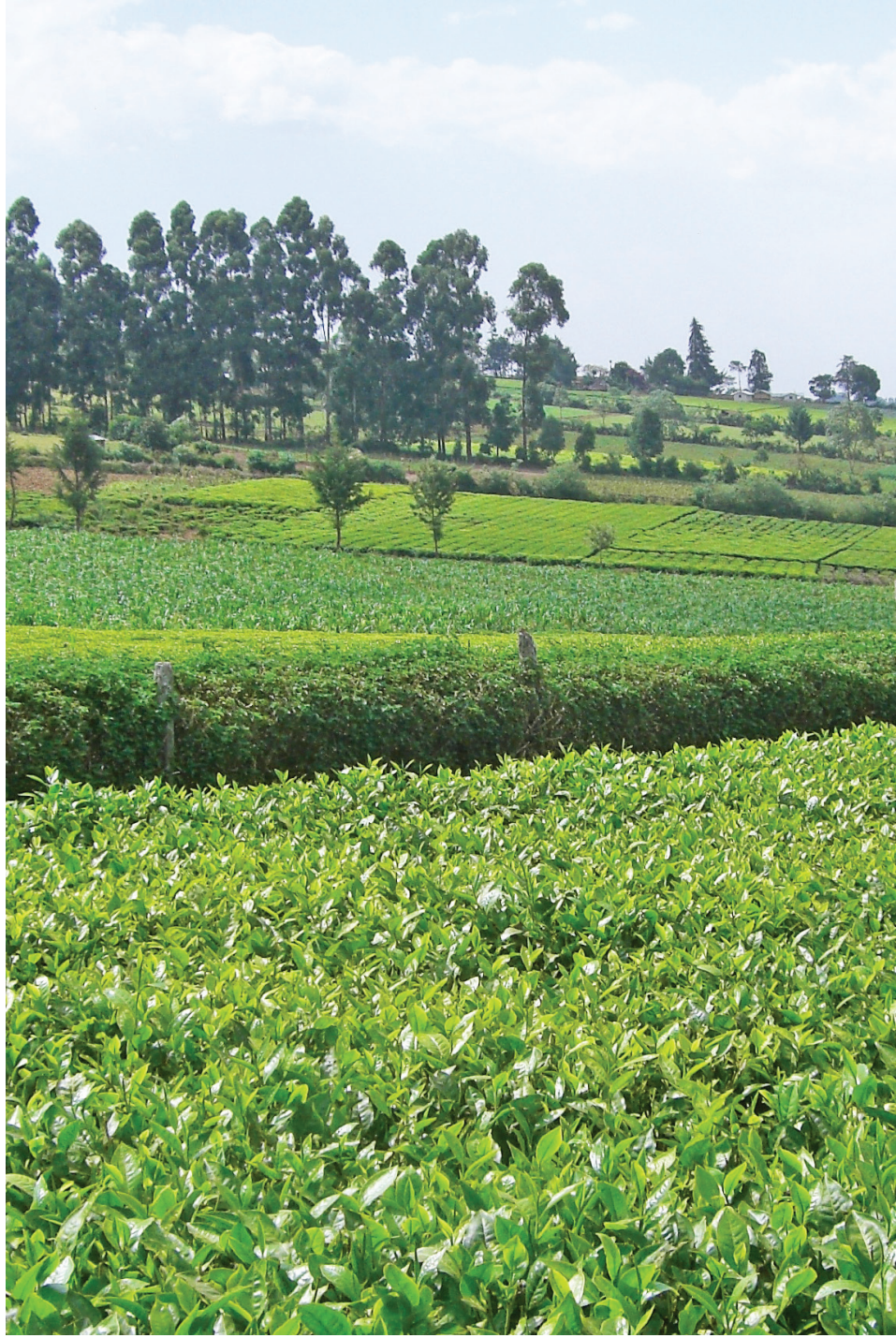
A mosaic of tea, maize and other annual crop production, eucalyptus woodlots and forest fragments comprises much of the Kericho landscape.