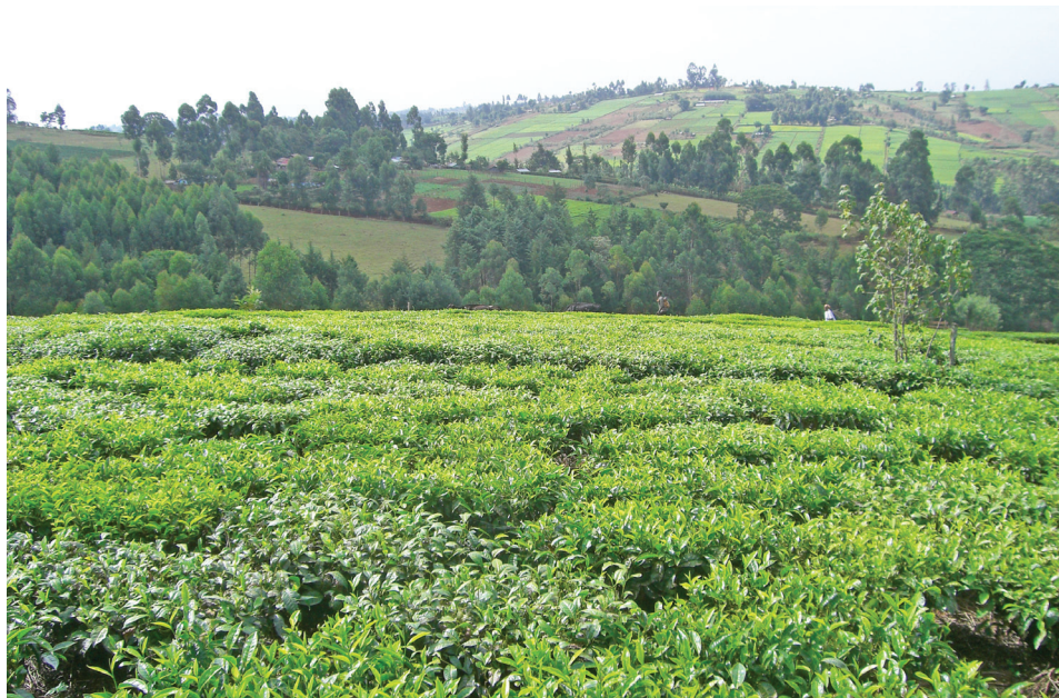
Figure 22.2 View of the Kericho landscape, which consists of a mosaic of tea production areas, annual crop parcels, eucalyptus woodlots, forest conservation areas, and human settlements.

unifying feature is tea, which is produced by large estates as well as smallholder farmers between the altitudes of approximately 1,800 and 2,200 meters. Smallholder farms are typically less than half a hectare in size, with most of the land planted with tea and usually no more than 20% reserved for food crops. Rural livelihoods reflect the composition of the land-use mosaic, with tea providing a primary income source, through wage labour on large tea estates as well as the sale of smallholder-grown tea. Additional livelihood sources include annual crop production for household consumption or sale in local markets and the sale of eucalyptus trees.